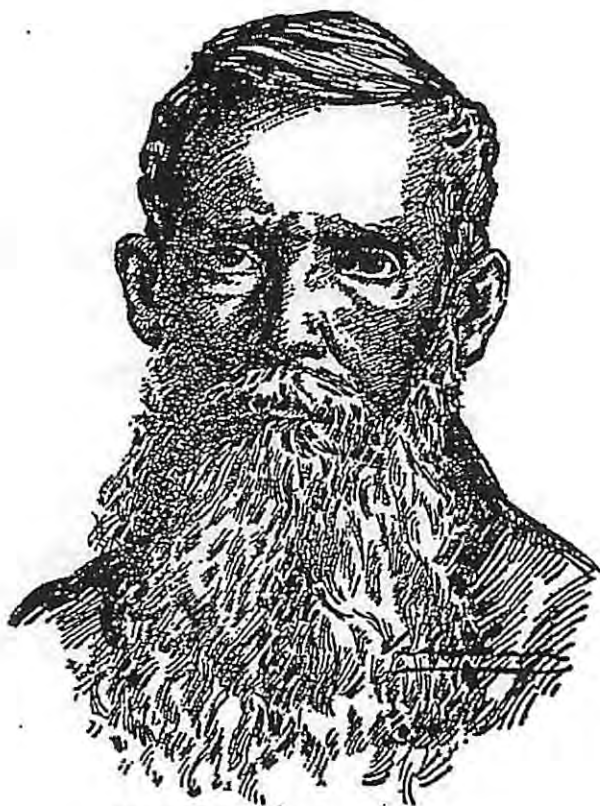
FRANCISCO VICENTE AGUILERA